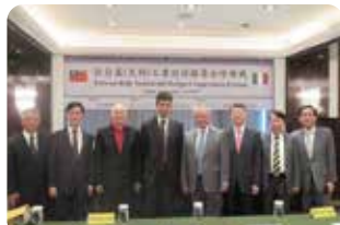
從台義(大利)工業設計探尋合作商机論壇 Taiwan-Italy Industrial Design Cooperation Forum

Conducting seminars on international economic situations