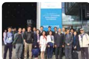
2017 赴英國、荷蘭綠能離岸風電海洋 機械產業參訪團 Taiwan Green Energy-Offshore Wind Industry Delegation