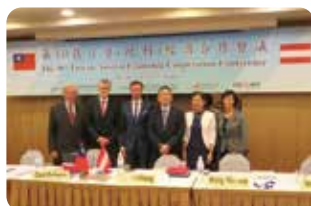
第10屆台奧(地利)經濟合作會議 The 10th Taiwan-Austria Economic Cooperation Conference

Hosting bilateral economic cooperation conference and organizing trade missions