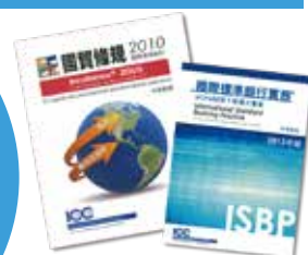
國際商會ICC出版品 ICC Publications

Managing affairs related to the Confederation of Asia-Pacific Chambers of Commerce and Industry and ICC