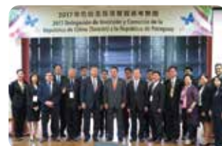
2017年巴西及巴拉圭投資暨貿易考察團 2017 Taiwan Investment and Trade Delegation to Brazil and Paraguay