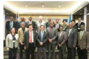
聖露西亞經貿暨投資商機說明會 Saint Lucia Business Opportunity Forum