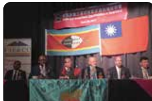
史瓦濟蘭王國經貿暨投資商機說明會 Trade and Investment Opportunities in Swaziland